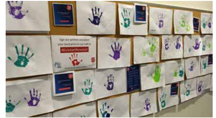
▲ A wall of palm-print signatures collected to go alongside the petition.

poured in during presentations at the local markets that even caught attention of the Ballarat media.