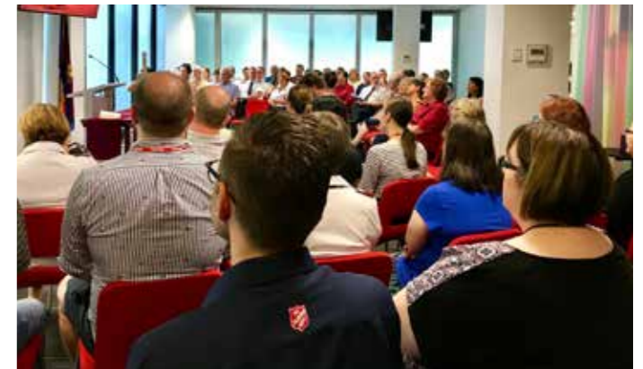
▲ The service at Territorial Headquarters in Melbourne.

of colonisation were then discussed, including Aboriginal deaths during settlement, the Stolen Generation, and the disparity between health and human rights for Aboriginal and Torres Strait Islanders.