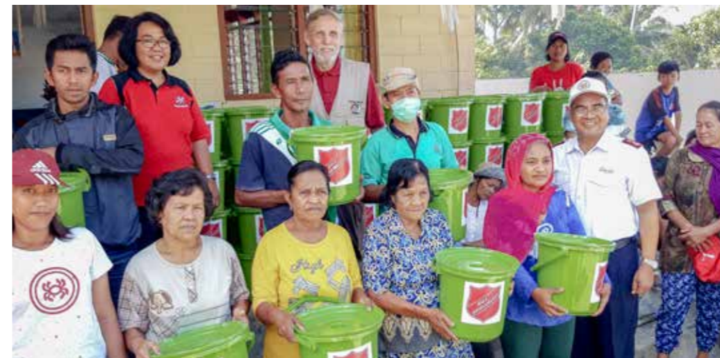
The Salvation Army is continuing its humanitarian support to many communities affected by the earthquake and tsunami that struck the Central Sulawesi region of Indonesia last year.

AN ESTIMATED 10,000 PEOPLE from Central America have arrived at, or are approaching, the United States-Mexico border after travelling through Mexico. While some have crossed into the US seeking asylum, several thousand of these migrants have congregated in the northern city of Tijuana, where The Salvation Army and other aid agencies are providing essential services.