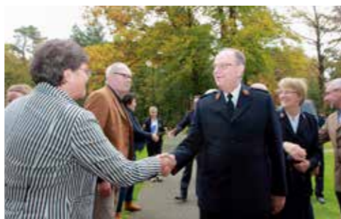
General André Cox and Commissioner Silvia Cox greet people at “The Connection” in the Netherlands.

The international leaders’ visit to the Netherlands concluded at a gospel celebration attended by 700 people, including the local mayor.