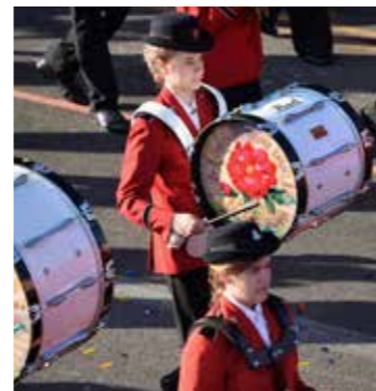
The Tournament of Roses Parade is always a colourful spectacle.

The next fundraising trek will take on the Great Wall of China in September next year, and in 2019 it will be the Kokoda Track. Details at salvos.org.au/adventure – Simone Worthing