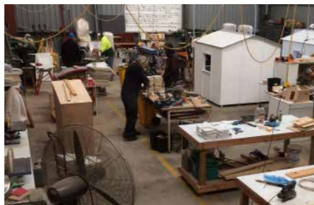
Members of the Ingle Farm Corps' Men's Shed designed the cubby houses and built two of them in the workshop.

The Cubby House Project is a partnership between The Salvation Army's Public