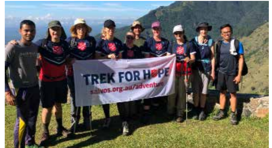
Participants in the Trek for Hope Sri Lanka enjoyed breathtaking scenery and challenging climbs.

Along the way, the trekkers were treated to tasty traditional cuisine made by the local villagers and stayed in a variety of mountain-top lodges, all with spectacular views.