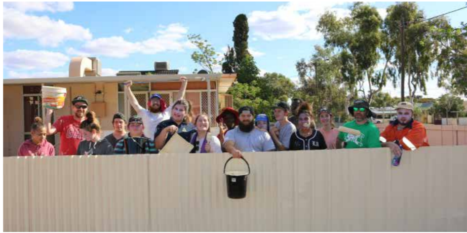
The team from Morley Corps travelled eight hours to Kalgoorlie to help out the local corps.