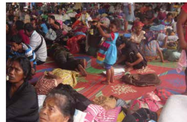
Hundreds of people affected by the volcan eruption in Indonesia are being housed by The Salvation Army.

The recent eruption of Mount Sinabung in Indonesia has increased the demand on The Salvation Army's Compassion in Action team which is working in the region.