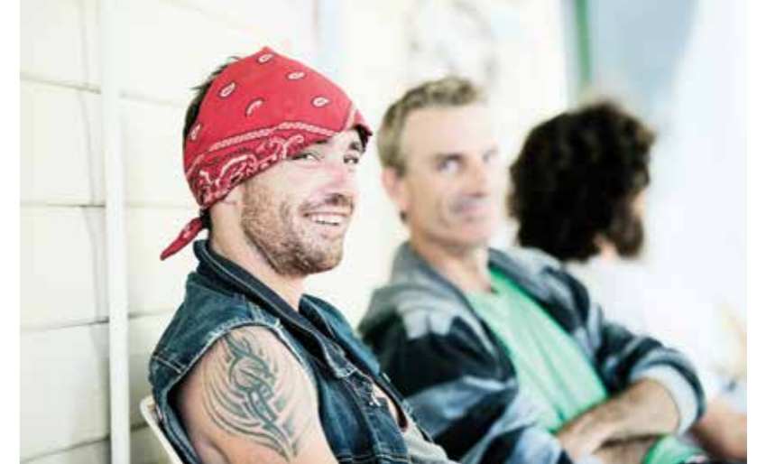
TOP TO BOTTOM: The community members who visit Streetlevel come from a wide range of backgrounds and represent different age groups, but all find it a place of acceptance, support and hope.

"We feel we are called to the whole Salvation Army, wherever that might be, and we will live that ethos and fight for justice wherever we are appointed," says Peter.