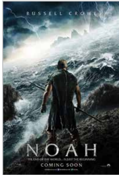
Russell Crowe plays the lead role of Noah in this epic story which misses the mark from a biblical point of view.