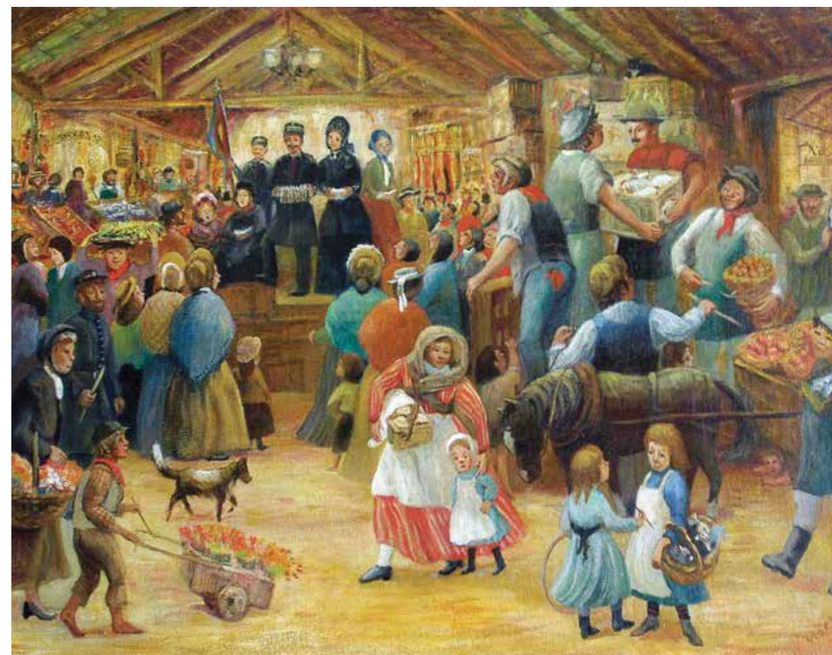
An artist's impression of the first meeting of The Salvation Army in Paddy's Market on 2 December 1882.