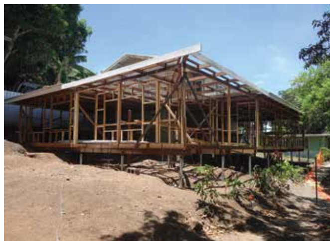
Work in progress at the Officer Training College in PNG.