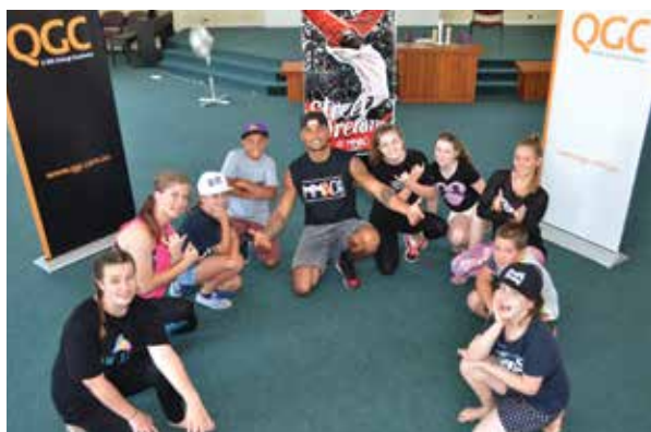
Children and instructors enjoy the inaugural summer intensive program at Gladstone Corps.

The Gladstone Corps Street Dreams program – the first regional expression of this program in the Australia Eastern Territory – held its first summer intensive in January at the Gladstone PCYC skate park. Most of the students then signed up for weekly classes, with four sessions now in progress each week, instead of just one. The intensive enabled the corps to connect with more than 30 youth, aged five to 18, and their families, 85 percent of whom have had no prior association with the corps.