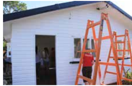
Volunteers, including professional tradesmen, renovated the duplex both outside and inside, making it ready for single mums with young children.

Refreshing the soul, restoring the dreams, and renewing the strength of vulnerable young mothers and their children is the goal of Besor Home, an innovative pilot project on the Gold Coast, based on a partnership between The Salvation Army and Global Care (the charity arm of Elevation Church). The project, which began in December last year, provides transitional and supported accommodation in the community for young mothers leaving The Salvation Army's Accommodation Service Gold Coast (Still Waters) and in need of ongoing assistance to rebuild their lives.