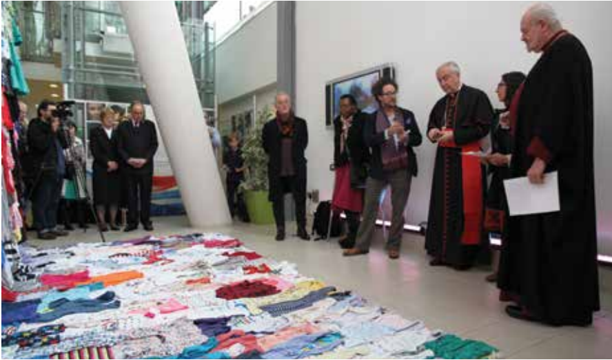
Leaders of different faiths in London gather to view the Sea of Colour patchwork at The Salvation Army's International Headquarters during Lent.