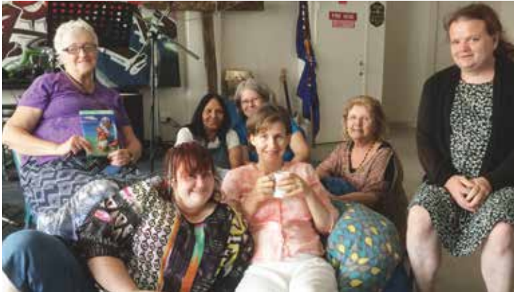
The Brisbane Streetlevel Mission "G.O.D" group provides a relaxed environment for women to connect.