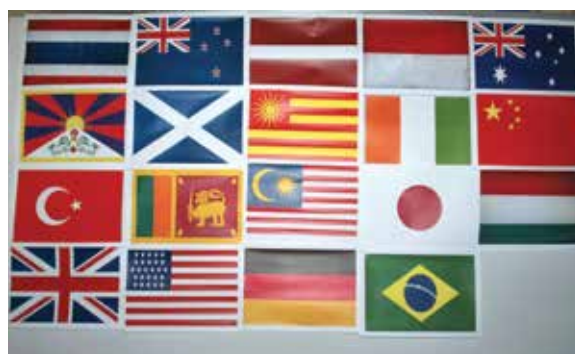
LEFT: Flags of countries represented in the Dee Why Corps.