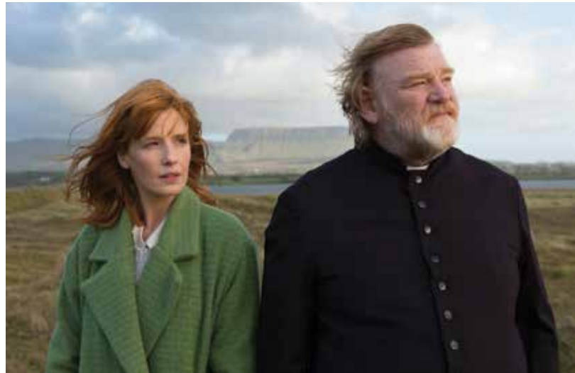
Brendan Gleeson and Kelly Reilly play father-daughter roles in the black comic thriller Calvary.