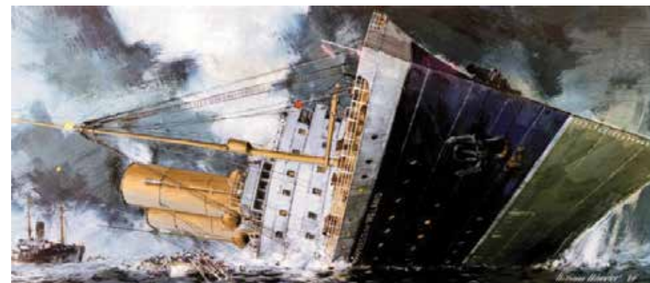
A painting depicting the sinking of the Empress of Ireland, in which about 130 Salvationists lost their lives. A special ceremony has marked the 100th anniversary of the tragedy.

Salvation Army leaders from the Canada and Bermuda Territory and the current Canadian Staff Band have taken part in a special ceremony in Quebec to mark the 100th anniversary of the sinking of the Empress of Ireland.