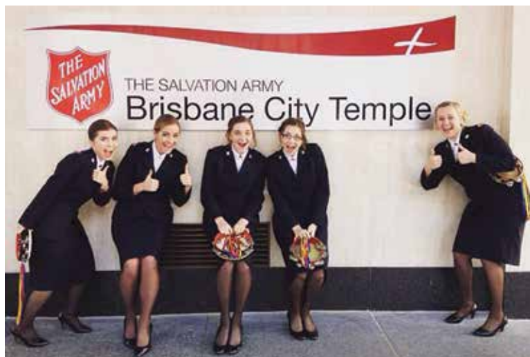
01. Members of the “Back to BCT” timbrel brigade get into the spirit of the anniversary weekend.