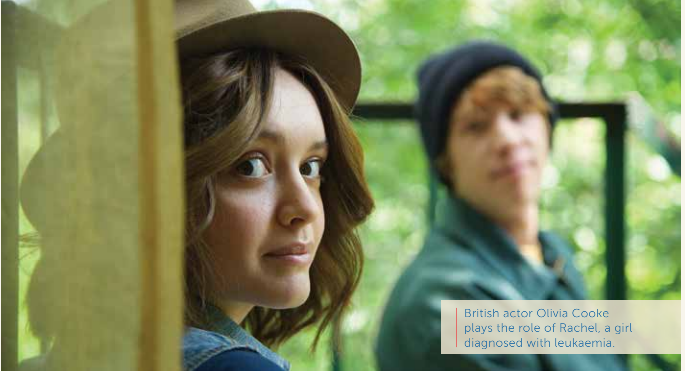
British actor Olivia Cooke plays the role of Rachel, a girl diagnosed with leukaemia.