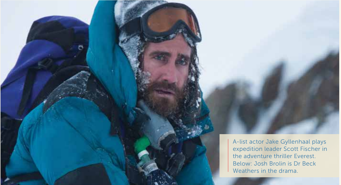
A-list actor Jake Gyllenhaal plays expedition leader Scott Fischer in the adventure thriller Everest. Below: Josh Brolin is Dr Beck Weathers in the drama.