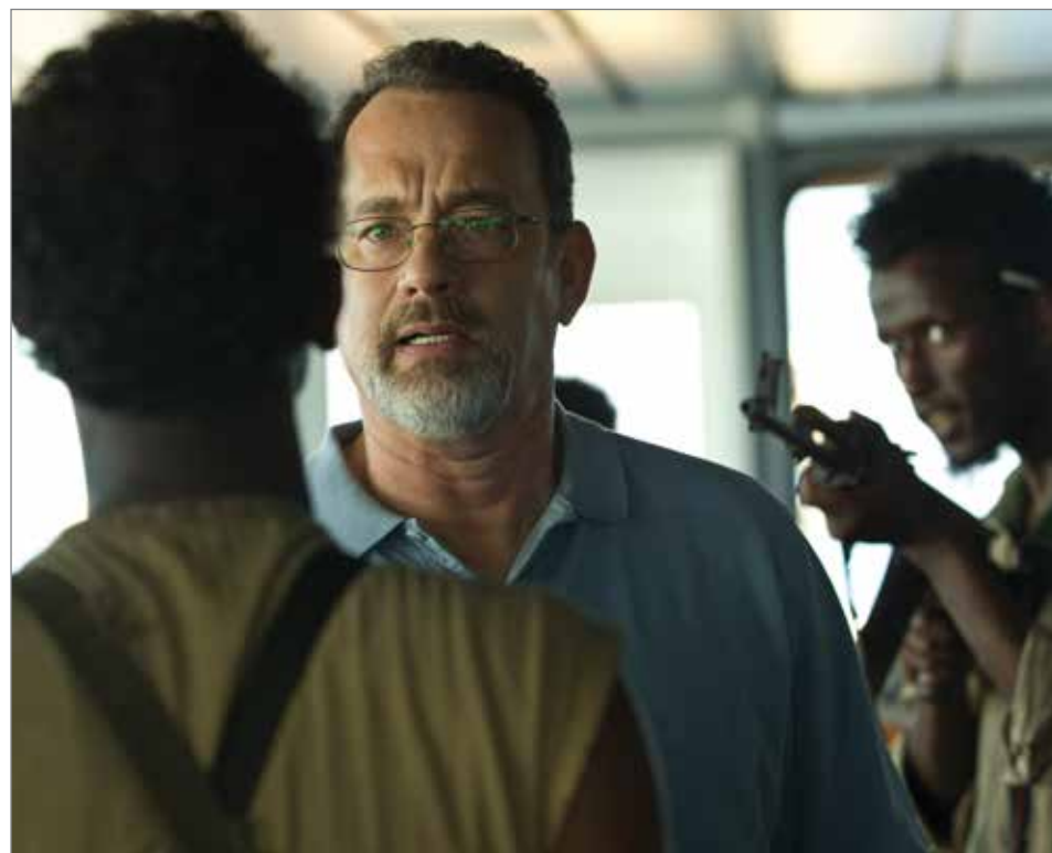
Tom Hanks stars as Captain Phillips in a movie based on the true story of a ship hijacking.

The film is based on Phillips' own best-selling book, A Captain's Duty: Somali Pirates, Navy SEALs, and Dangerous Days at Sea . Speaking from the film's set the real