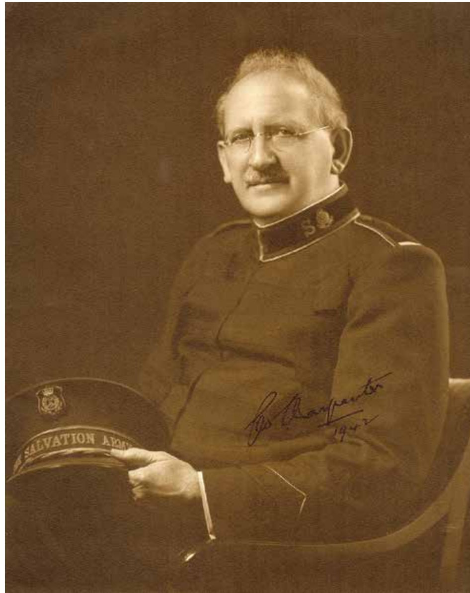
General George Carpenter was The Salvation Army's world leader from 1939-1946.

While financial challenges in Canada were different from South America, George Carpenter soon discovered the Great Depression which had swept the world had left a severe stain on resources there. However, he soon realised that what