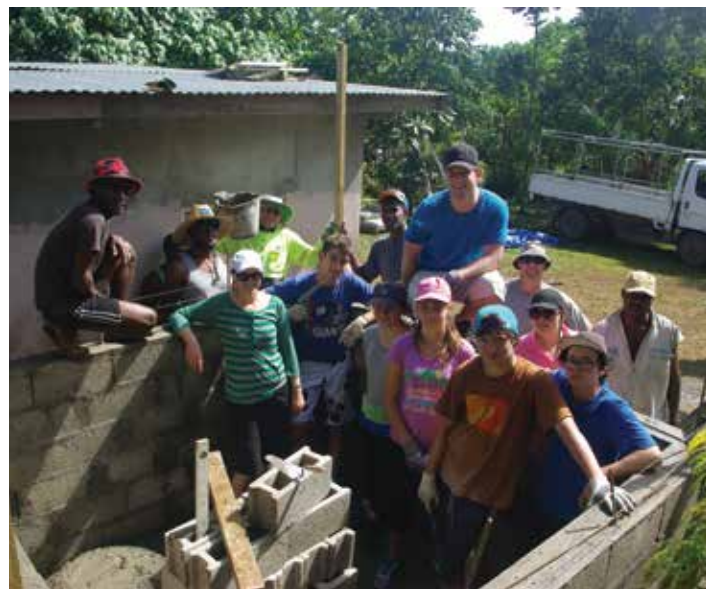
Some of the Tarrawanna workers share their achievement of reaching the halfway mark with local helpers.

"I would encourage corps to discover the opportunities for themselves."