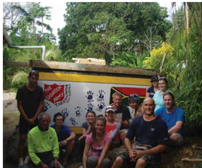
The job is done and artwork added to the water tank wall to remind the local village that Tarrawanna Salvation Army has been in their area.