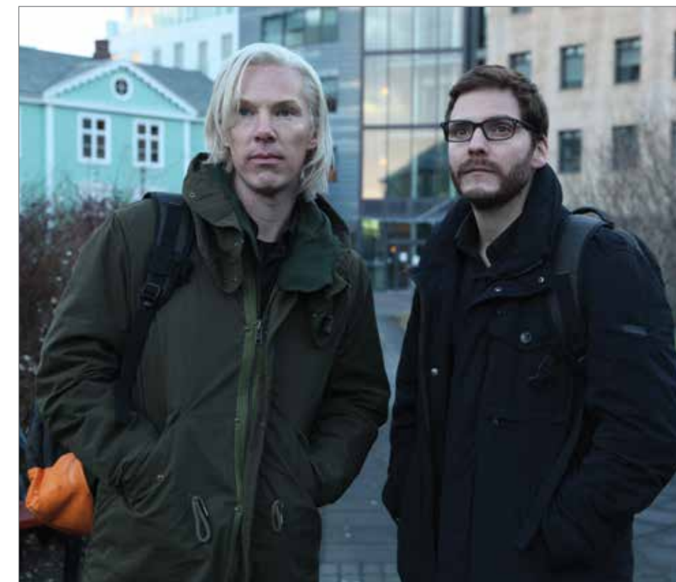
Benedict Cumberbatch (left) and Daniel Bruhl star in The Fifth Estate .

What's actually required is a mouth controlled by God's wisdom. Benedict Cumberbatch might pick up awards for his nuanced portrayal of a man obsessed with spreading the truth, but we're unlikely to come away from The Fifth Estate knowing where love would draw the line.