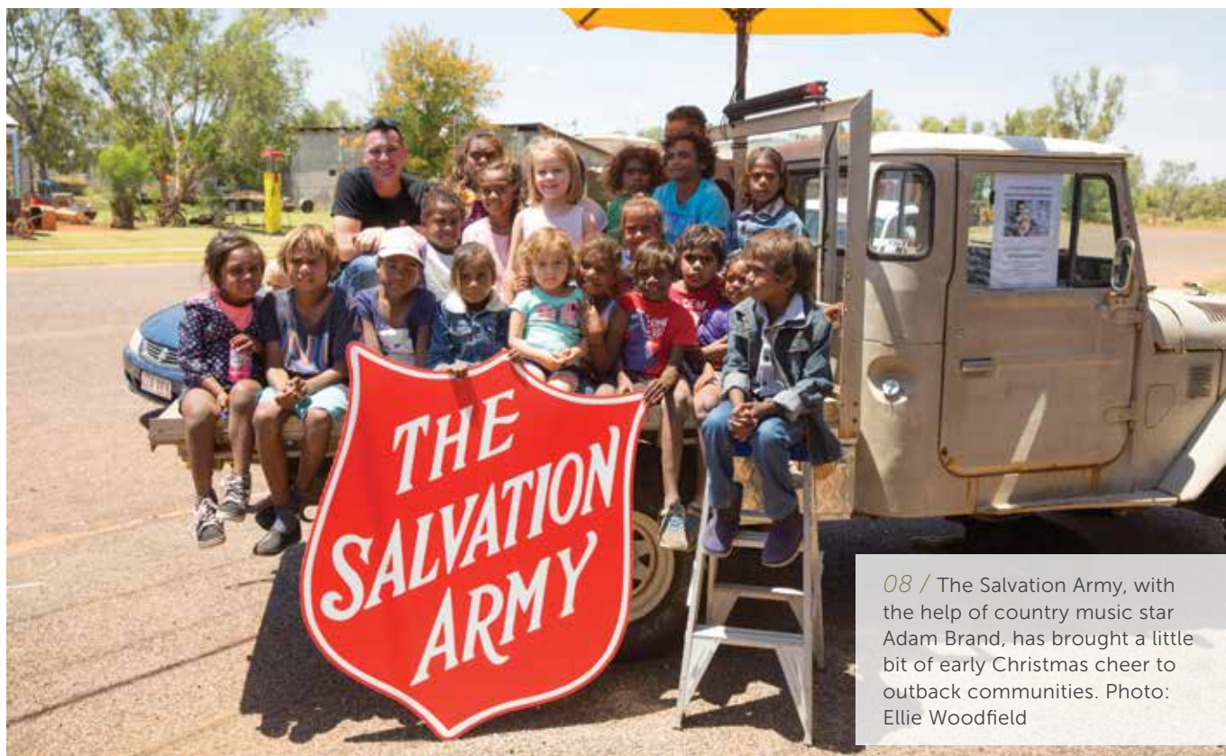
08 / The Salvation Army, with the help of country music star Adam Brand, has brought a little bit of early Christmas cheer to outback communities.