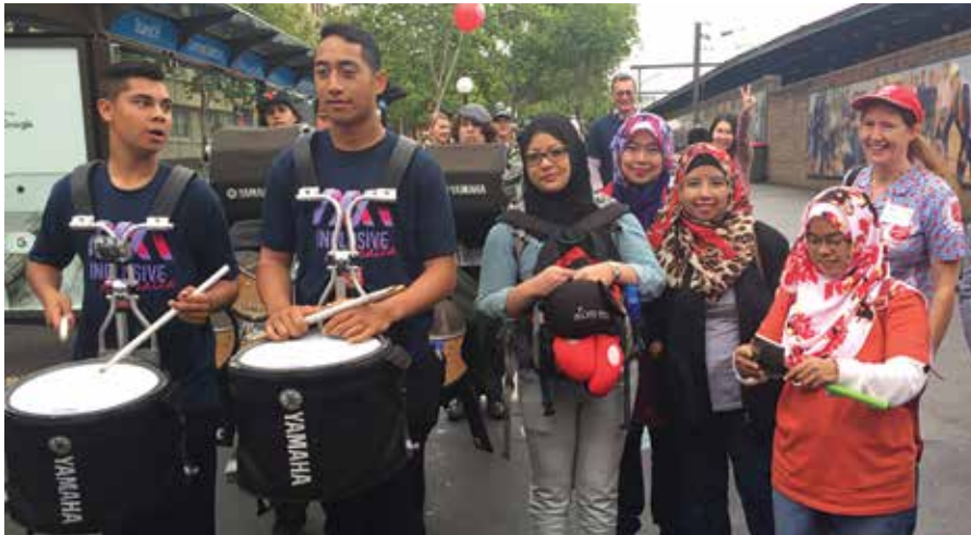
Salvation Army drummers accompany participants of the Walk Together parade in Sydney on 22 October.

The Salvation Army's Syrian and Refugee program this year participated in the Walk Together parade to celebrate cultural diversity in Australia.