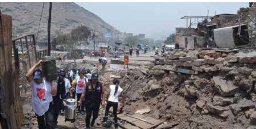
Salvation Army workers deliver food and water to the fire-ravaged community in Lima.

The Salvation Army in Peru has been helping more than 400 families whose homes were destroyed in a fire that swept through the Cantagallo community in Lima, the capital city. Cantagallo is a shanty area, consisting primarily of simple wooden huts, that has been home to the Shipiba indigenous people since 2000.