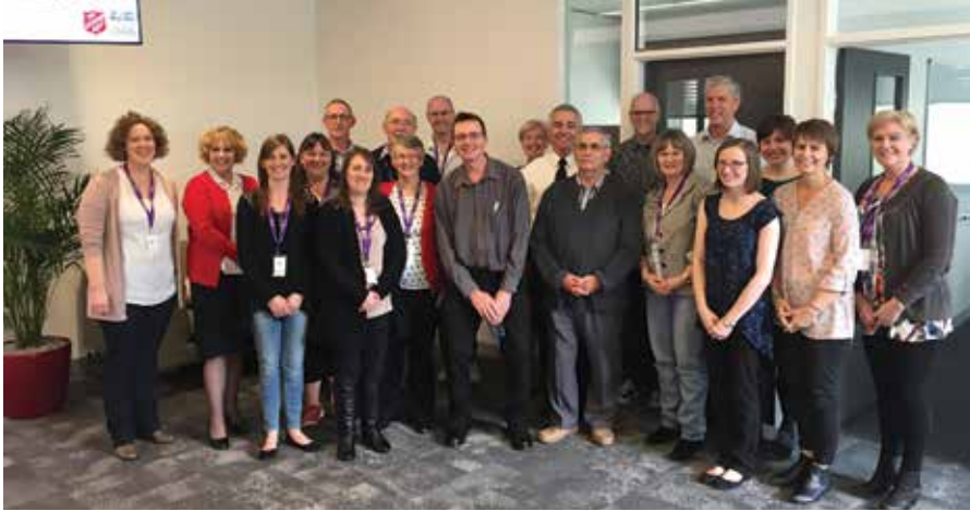
A delegation from the New Zealand, Fiji and Tonga Territory took part in the conference.

More than 80 Salvation Army academics, practitioners, officers and soldiers explored biblical, contextual and theological perspectives of “salvation” at the recent Tri-Territorial Thought Matters Conference in Melbourne. The only conference of its kind in The Salvation Army world, the event drew speakers from Australia Eastern, Australia Southern, New Zealand, Fiji and Tonga, and Canada & Bermuda territories, to explore