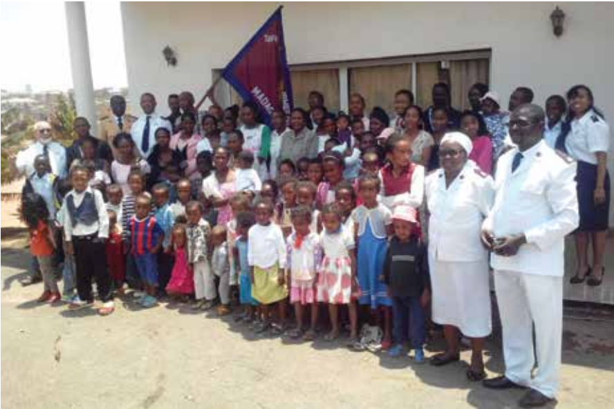
Salvation Army leaders and members of the Alakamisy community, including many children, gather outside the hall following the official ceremony to open the work in Madagascar.